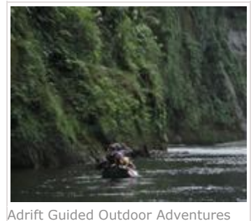
Adrift Guided Outdoor Adventures